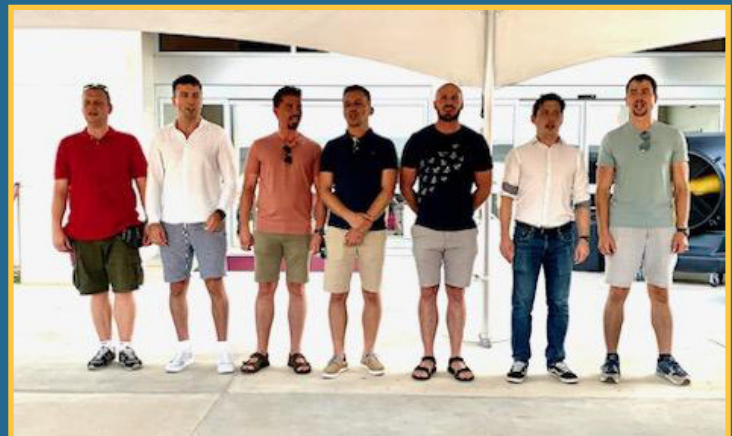
Polish airmen entertain crowd with a song