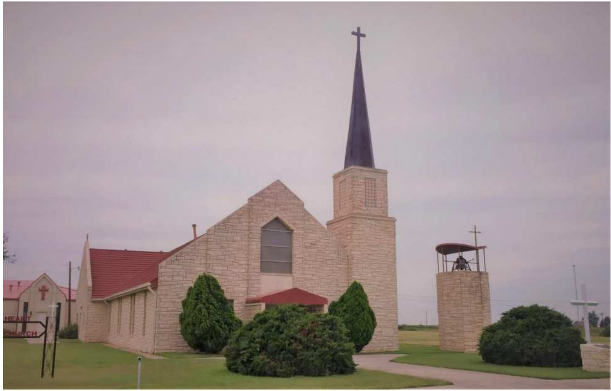
Present Sacred Heart Church