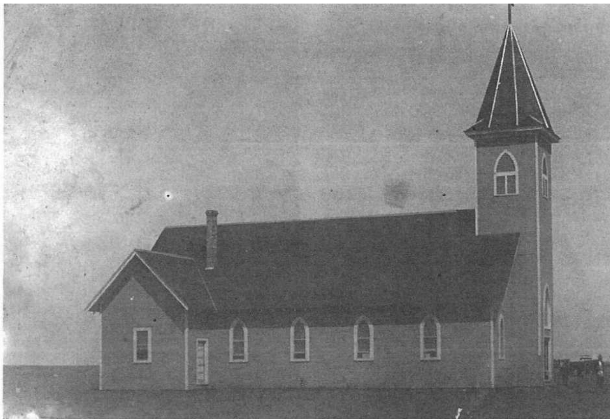
The Sacred Heart Church is dedicated on May 30, 1913